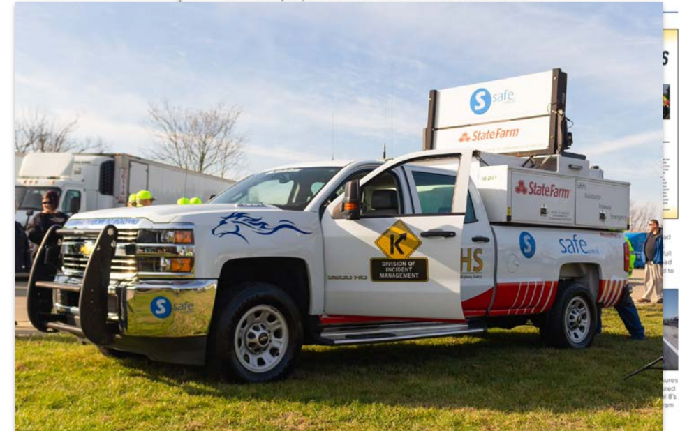
For example, to raise awareness about your program.

As the economic impact of COVID-19 begins to be realized by departments of transportation and tollroad authorities across the country, budgets will be tightened and public services will be at risk of losing vital funding. In June 2020, Kentucky Transportation Safety Cabinet saw its entire budget for the Safety Assistance for Freeway Emergencies (S.A.F.E.) patrol cut in a single legislative session. There was no forewarning and no opportunity to repel the decision. In two weeks time, on July 1, 2020, the Kentucky S.A.F.E. patrol ceased operation. Before your Safety Service Patrol program comes under threat, it is important to be proactive, to promote your patrol services, and to create a highly targeted campaign to demonstrate your patrol's return on investment to state decision makers.